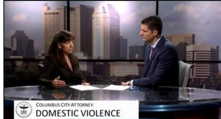
<u>Click to watch the video</u> about our Domestic Violence & Stalking Unit, filmed last month to recognize October as Domestic Violence Awareness Month.

That's important because 10 million people a year in the United States