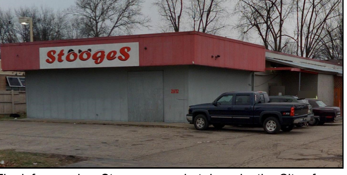
The infamous bar Stooges was shut down by the City of Columbus in 2017—but began operating again as an illegal after-hours club in February, immediately increasing crime in the area.

A business with a <u>disturbing history</u> of violence and crime was boarded up for the second time in less than two years after a judge granted the city's request for an emergency restraining order. The bar, formerly known as Stooges , was declared a public nuisance in 2017 and ordered closed until last September. The City Attorney's office also entered into an agreed court order at the time to further prohibit the sale, possession, storing, or consumption